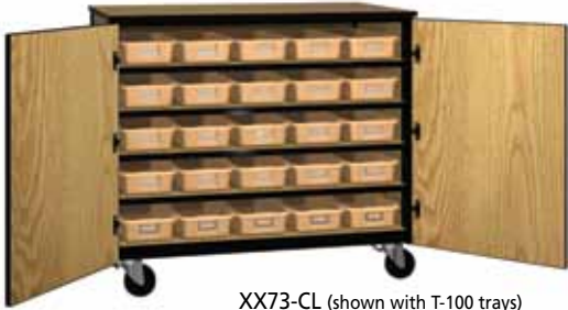
XX73-CL (shown with T-100 trays)