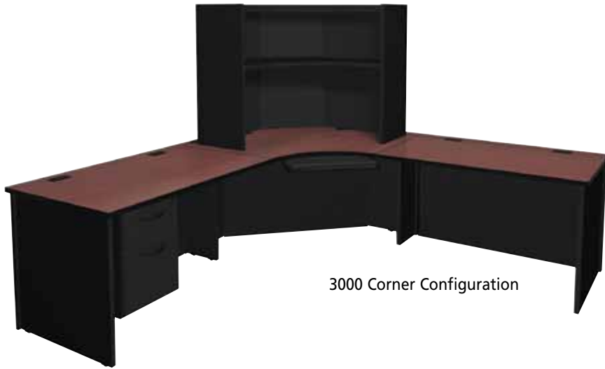
3000 Corner Configuration