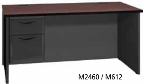
M2460 / M612

At work or at home, your office is your place to be organized and stay focused. It is our desks and freestanding pieces that give you the flexibility to create the best environment for the way you work. After all you spend most of your time here, you deserve only best.